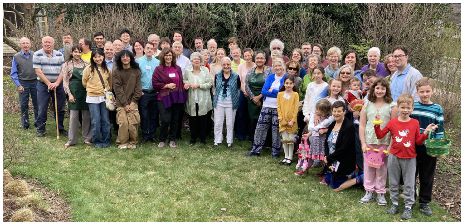
The Annual Herndon Friends Easter Portrait

As we work for peace, are we nourished by peace within and among ourselves?